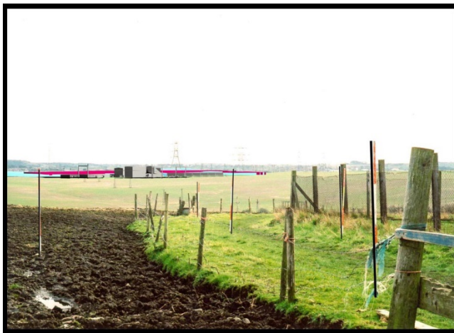
Figure 1 Aligning model in photograph to reference points (surveyor's rods).