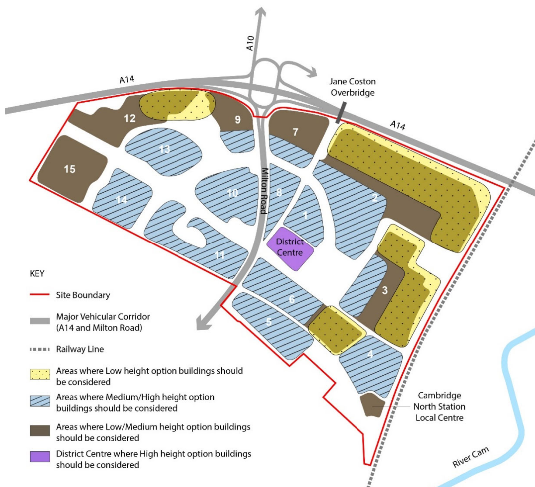
Diagram 1: Graphic showing potential areas of development heights

5.11 The height and massing of buildings should avoid dominating views of the skyline from the east and should avoid creating an abrupt transition from development to rural edge. The consented hotel and office buildings of up to eight storeys in height at the Cambridge North Station Local Centre present an opportunity for further medium or high development in this location. However, the height and massing of further development would need careful consideration to avoid compromising the quality and character of views and landscape in the River Cam Corridor LCA and the western part of the Eastern Fen Edge LCA and to avoid extending development across the skyline.