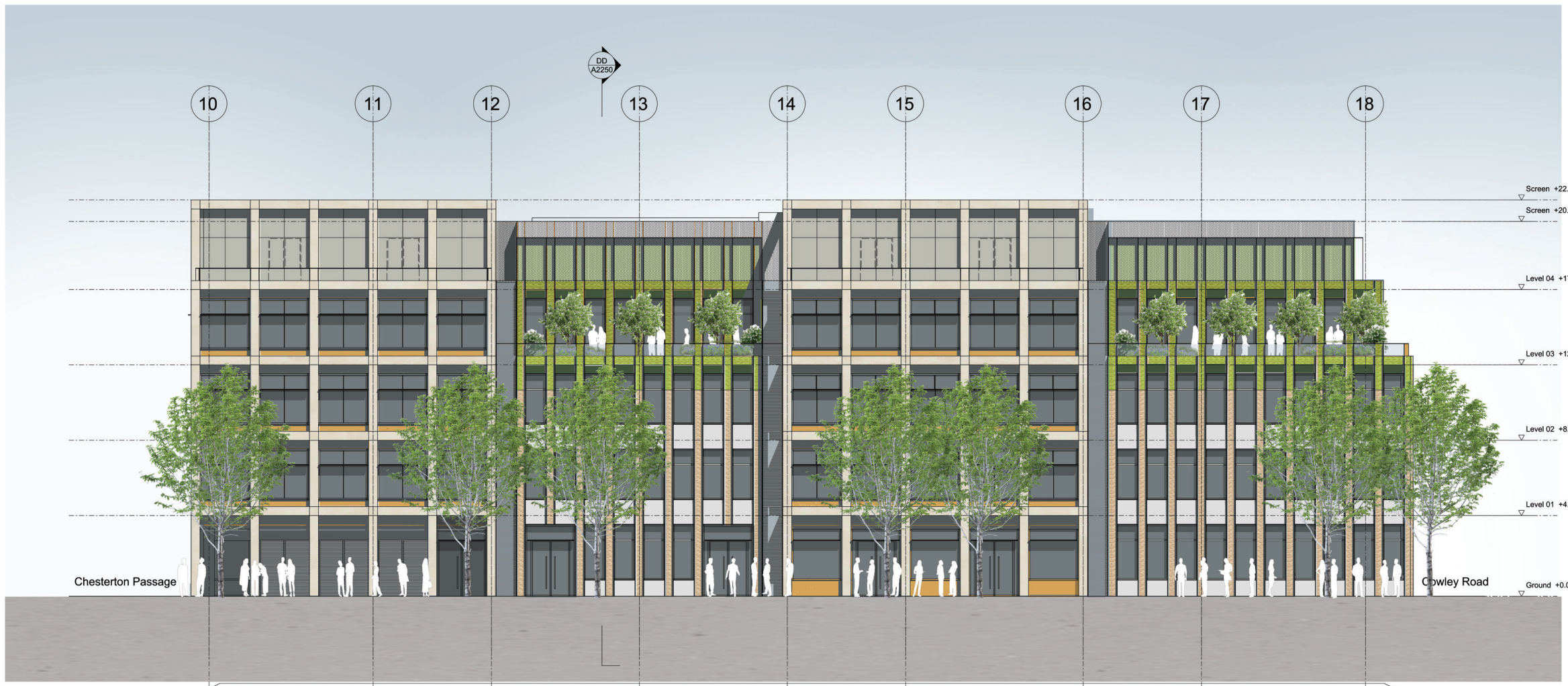
3 Station Row S7 laboratory Illustrative rendered elevation - please note planting is indicative, refer to landscape architect's plans for location and details 1:100