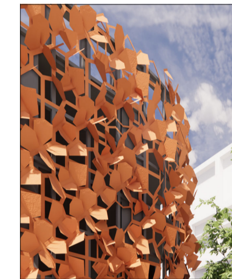
Facade Type 01: Foliage Panels