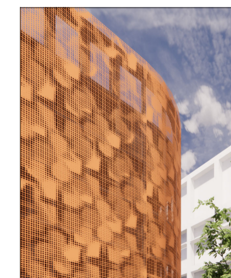
Facade Type 02: Perforated Panels

NOTES -All heights measured from FFL 0.00m (6.52m AOD)