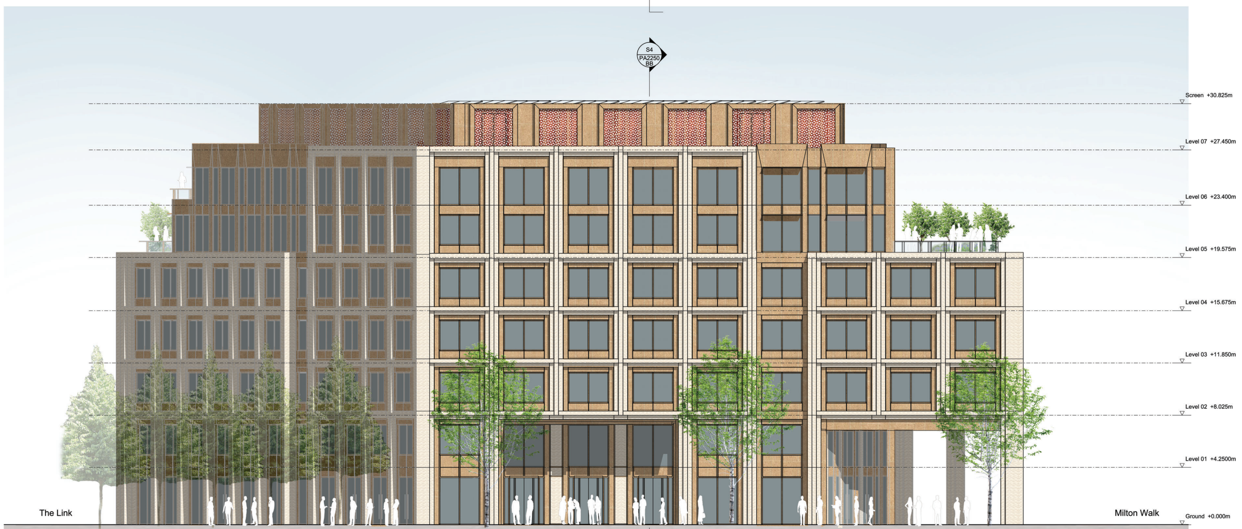
Illustrative rendered elevation - please note planting is indicative, refer to landscape architect's plans for location and details