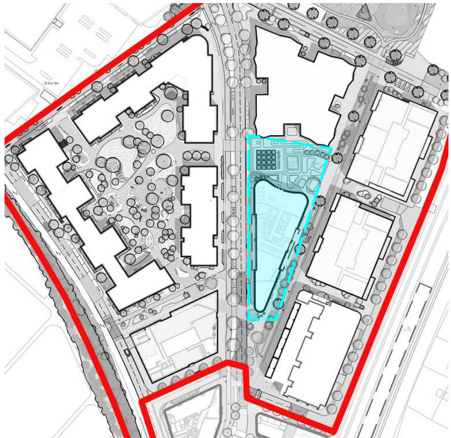
P-2 Areas of Meanwhile Use Scale: NTS