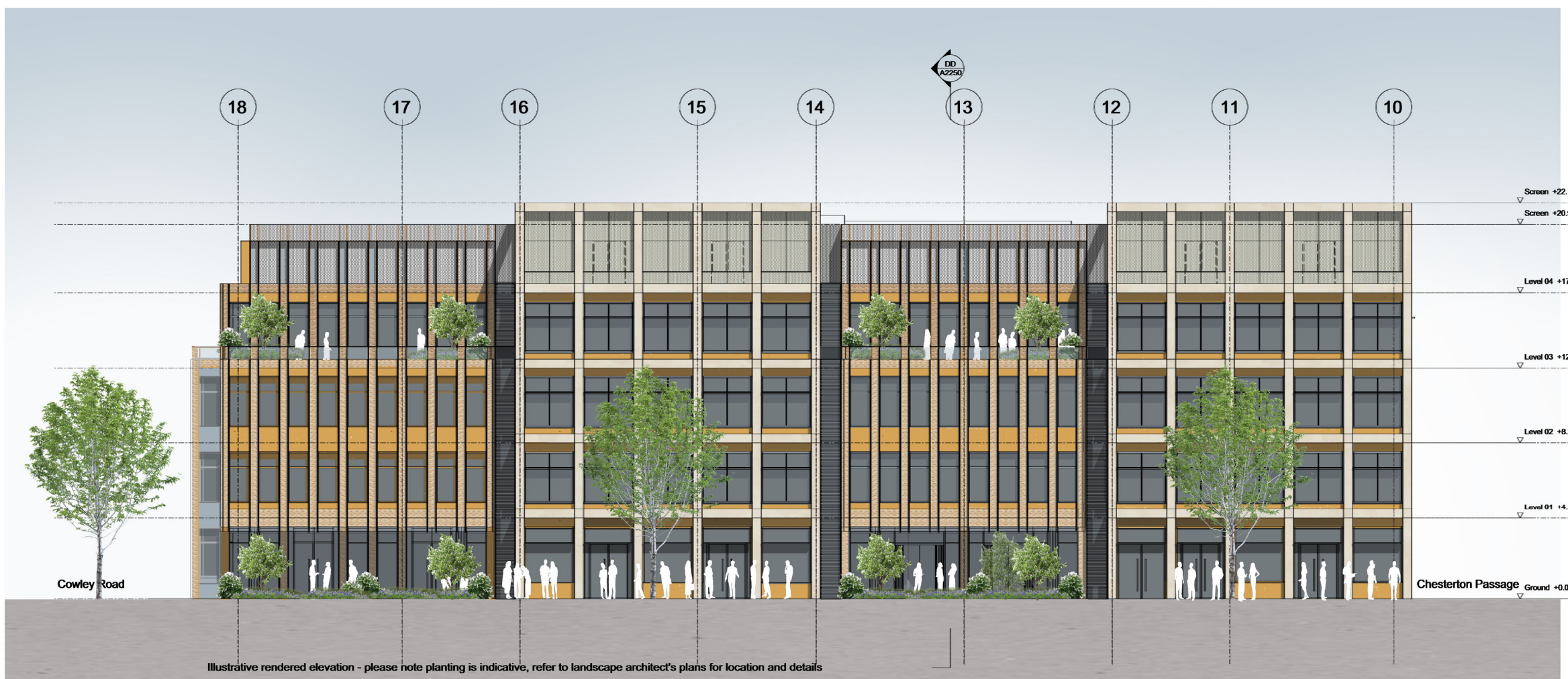
Illustrative rendered elevation - please note planting is indicative, refer to landscape architect's plans for location and details

Project No. 1818 Draw No. PA2200 Rev No. 01