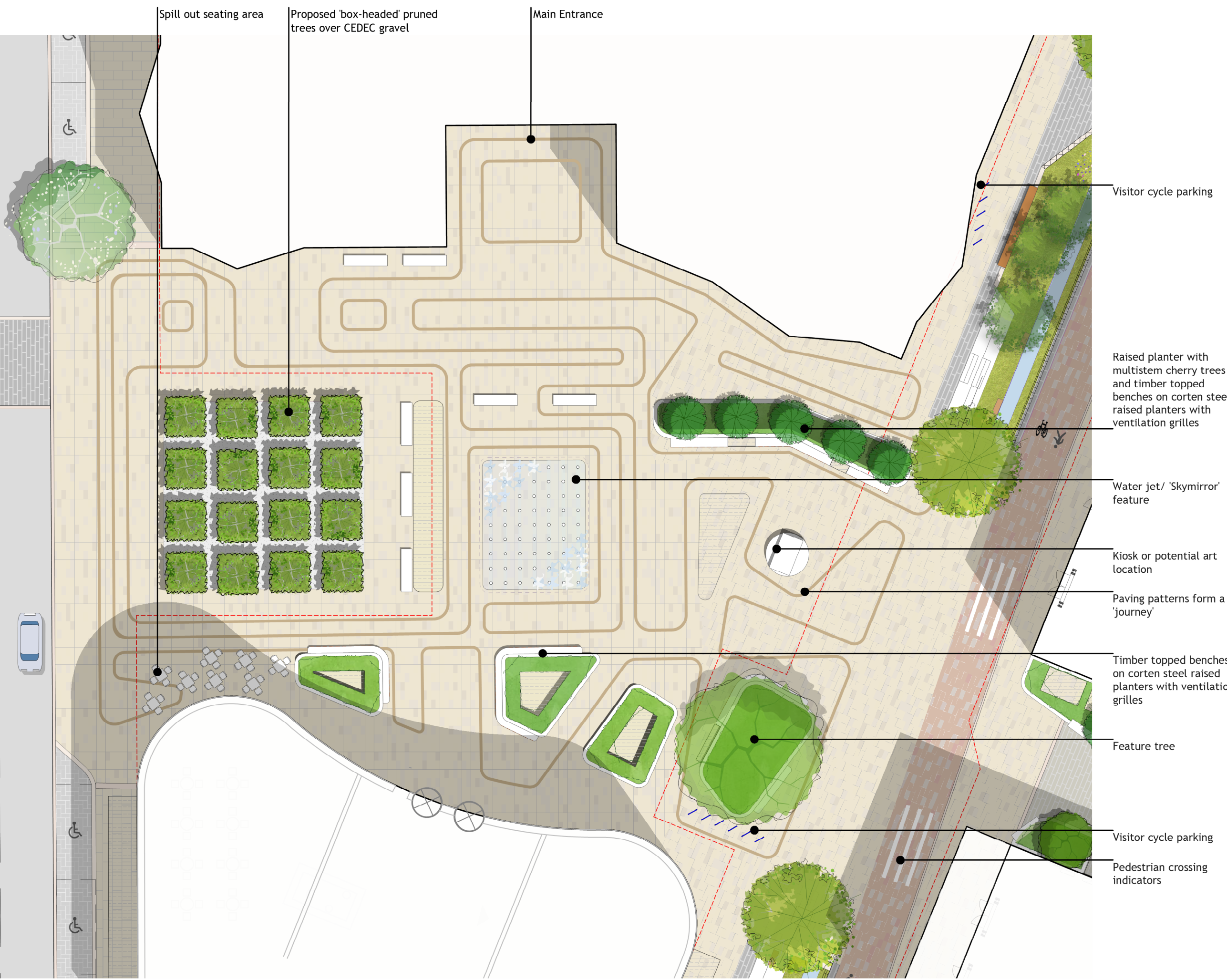
P-1 Chesterton Square- Plan Scale 1:250 @ A3

info@robertmyers-associates.co.uk www.robertmyers-associates.co.uk DO NOT SCALE FROM THIS DRAWING © Robert Myers Associates