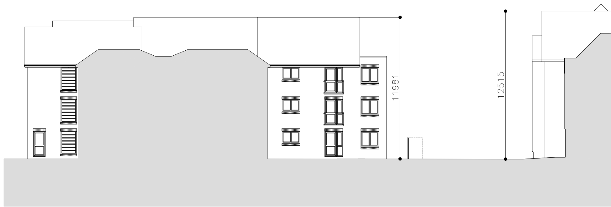
Comparison of Rear Portion of Proposed Building with consented Care Home to the south