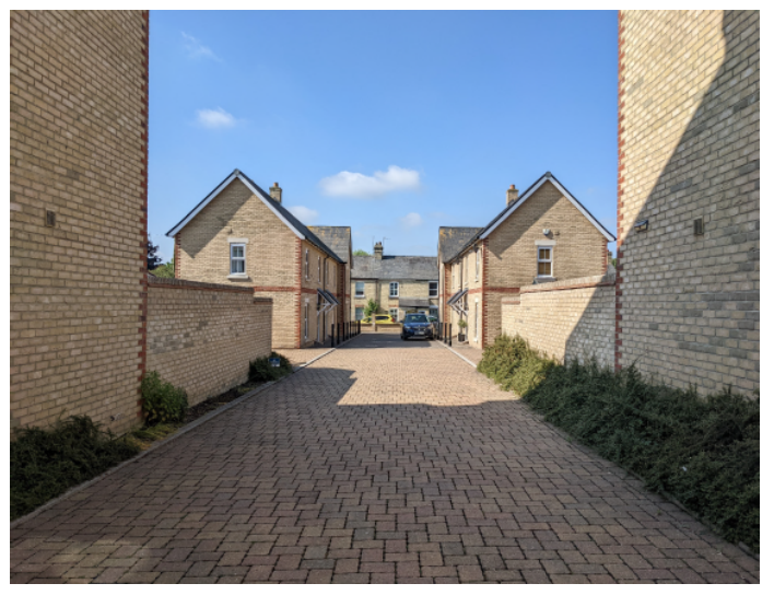
Fletcher's Way - Front Elevations within 8m of each other in a mews-type arrangement. Constructed 2014.