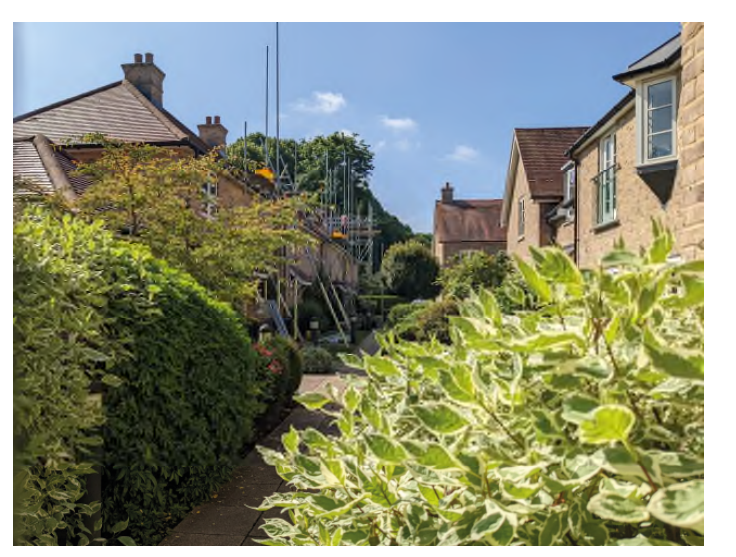
Old School Court. Constructed 2014. Internal Overlooking Distances vary. Left in this image are cottages and right is a block of retirement flats. Window to Window distance is less than 10m.