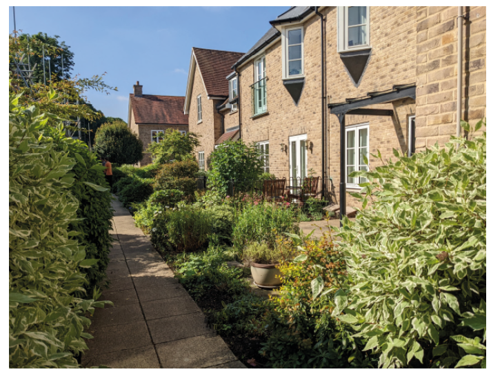
A closer view of the windows to the retirement flats.