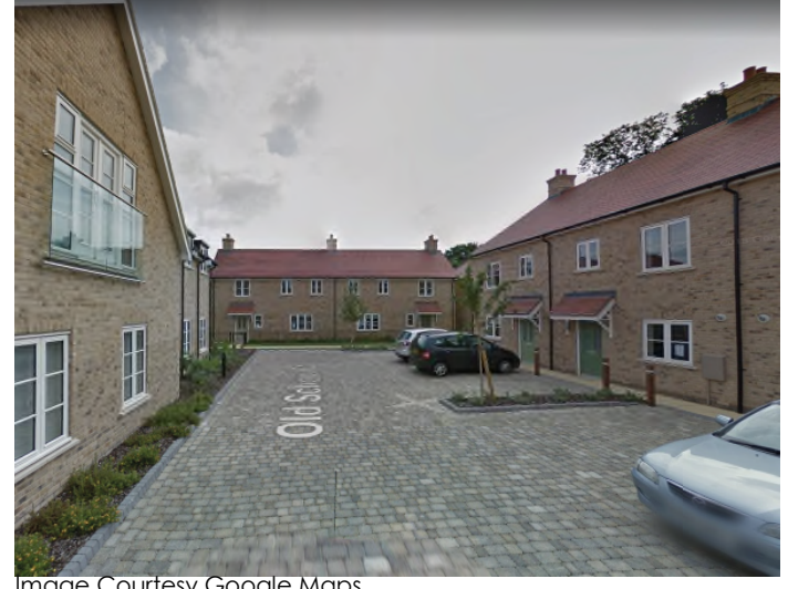
Cottages and Flats with less than 13m window to window distance.