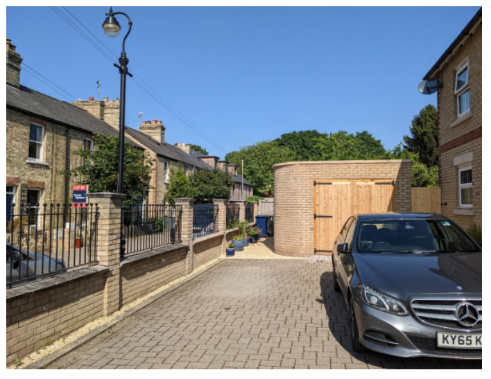
Front elevations within 15m of front wall of existing properties fronting Granta Terrace.