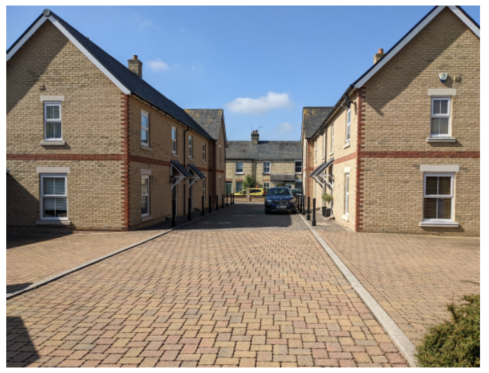
Closer View of the centre plots