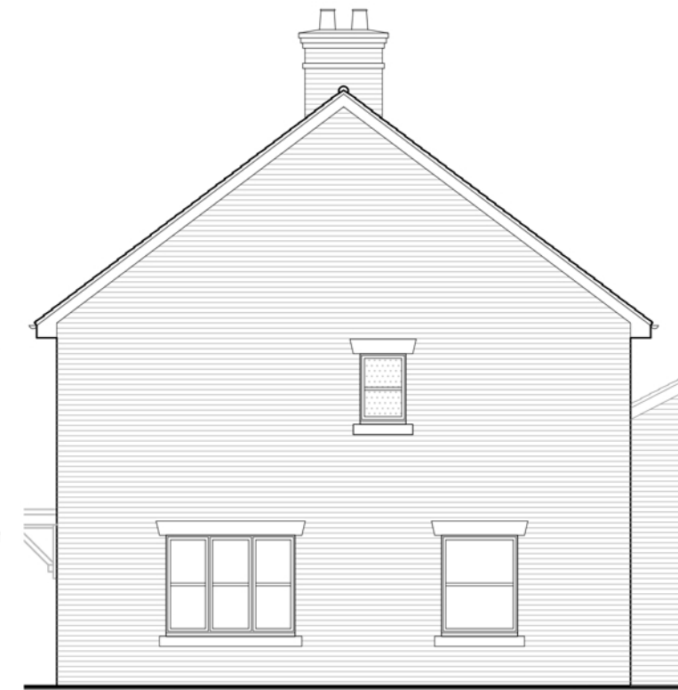
PLOT 67 - SIDE ELEVATION 1