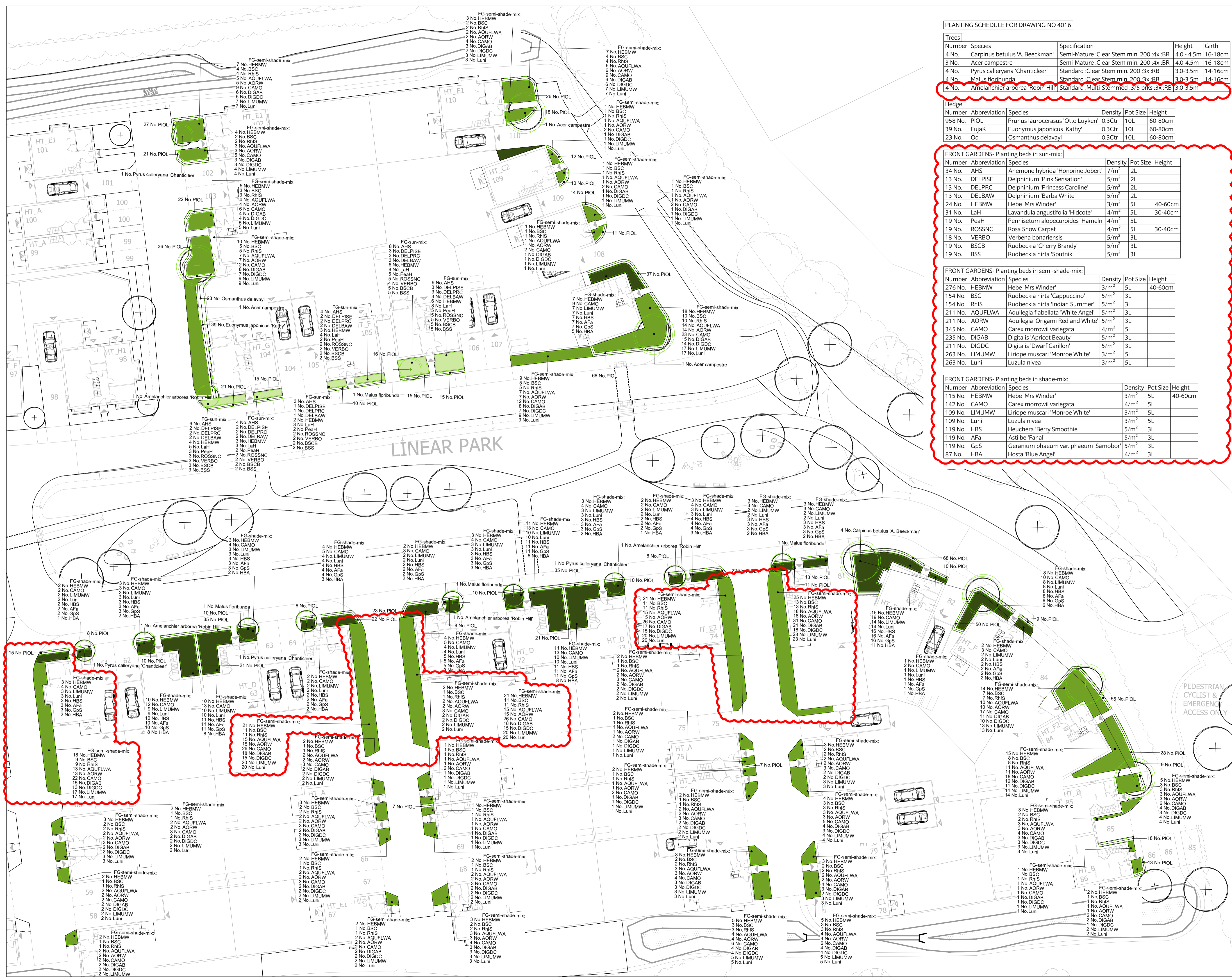
PLANTING SCHEDULE FOR DRAWING NO 4016