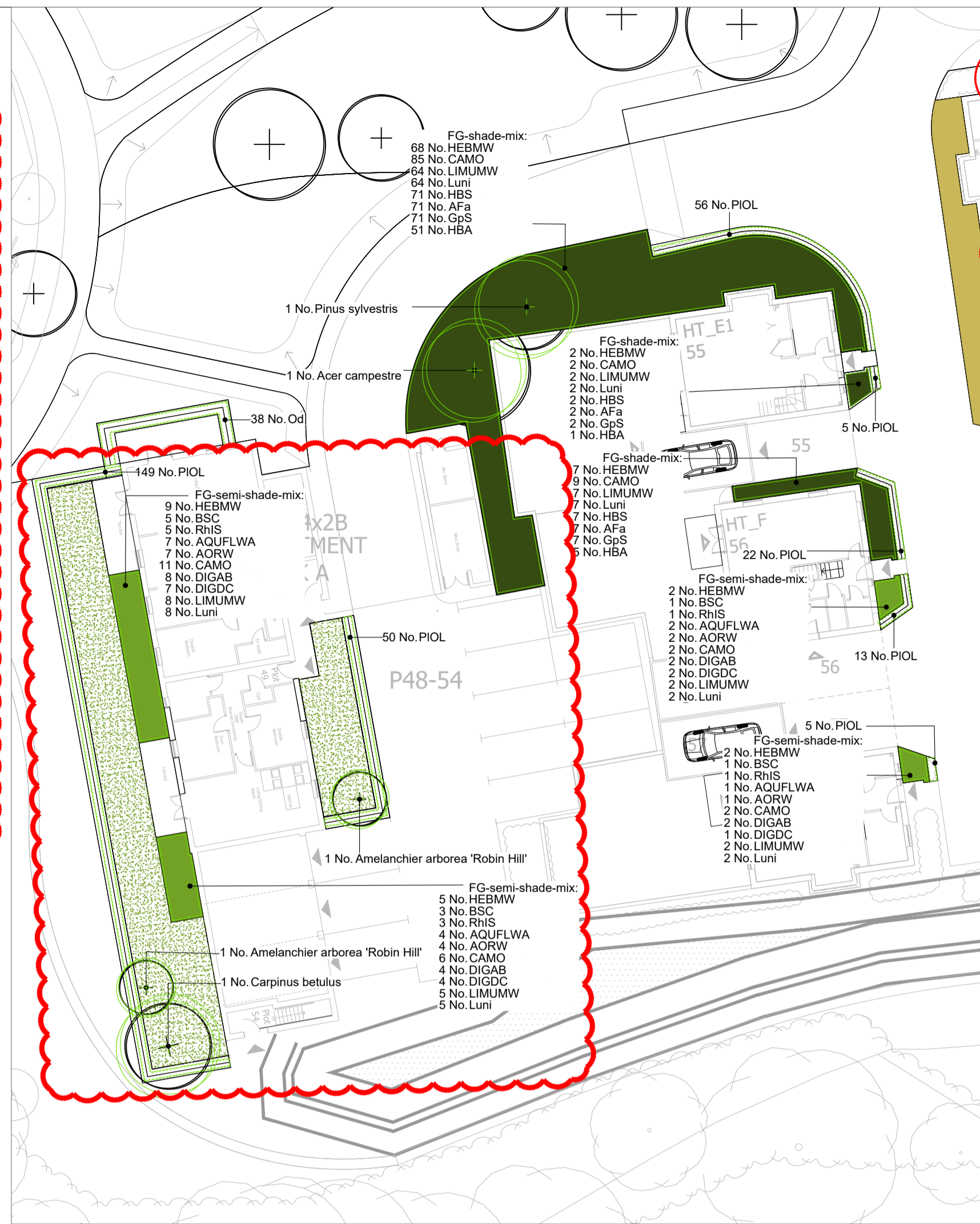
PLANTING PLAN B