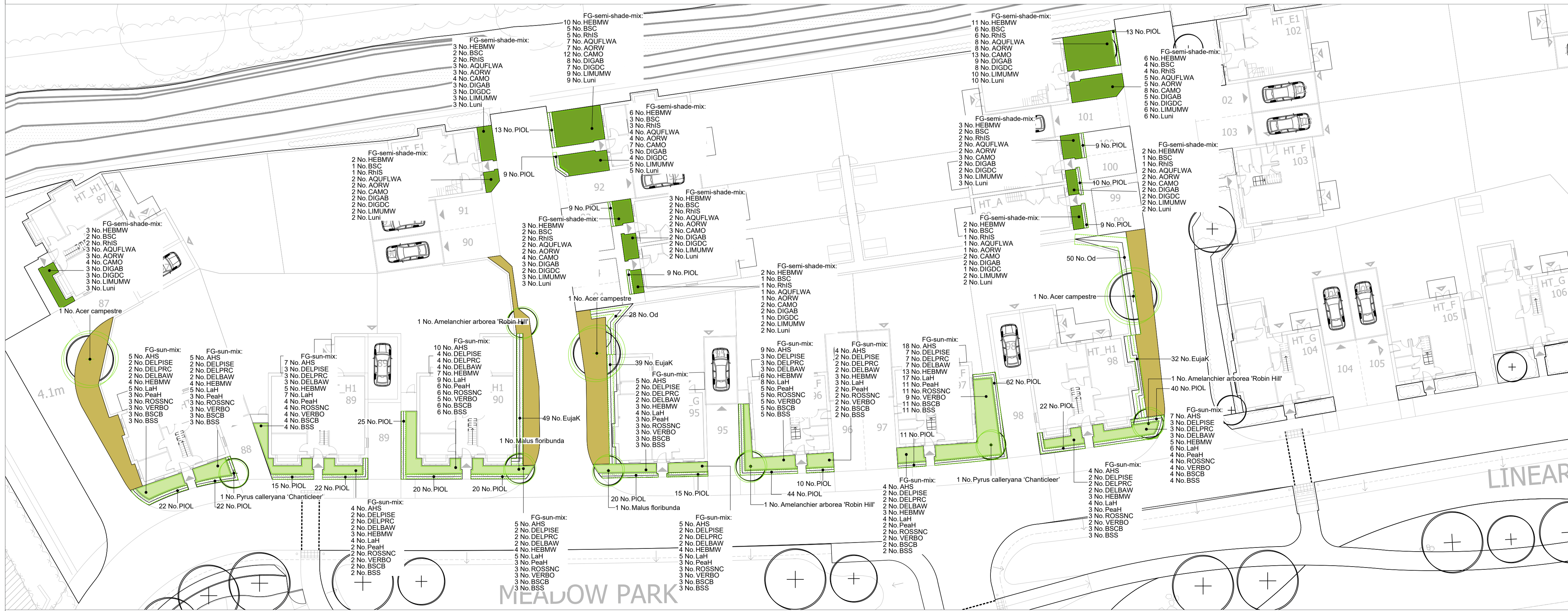
PLANTING PLAN C

Drawing number TRF-CBA-1-GF-M2-L-4015 Revision P3