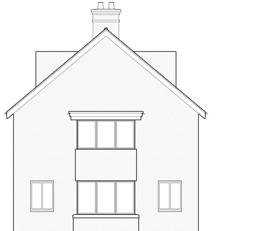
SIDE ELEVATION 2