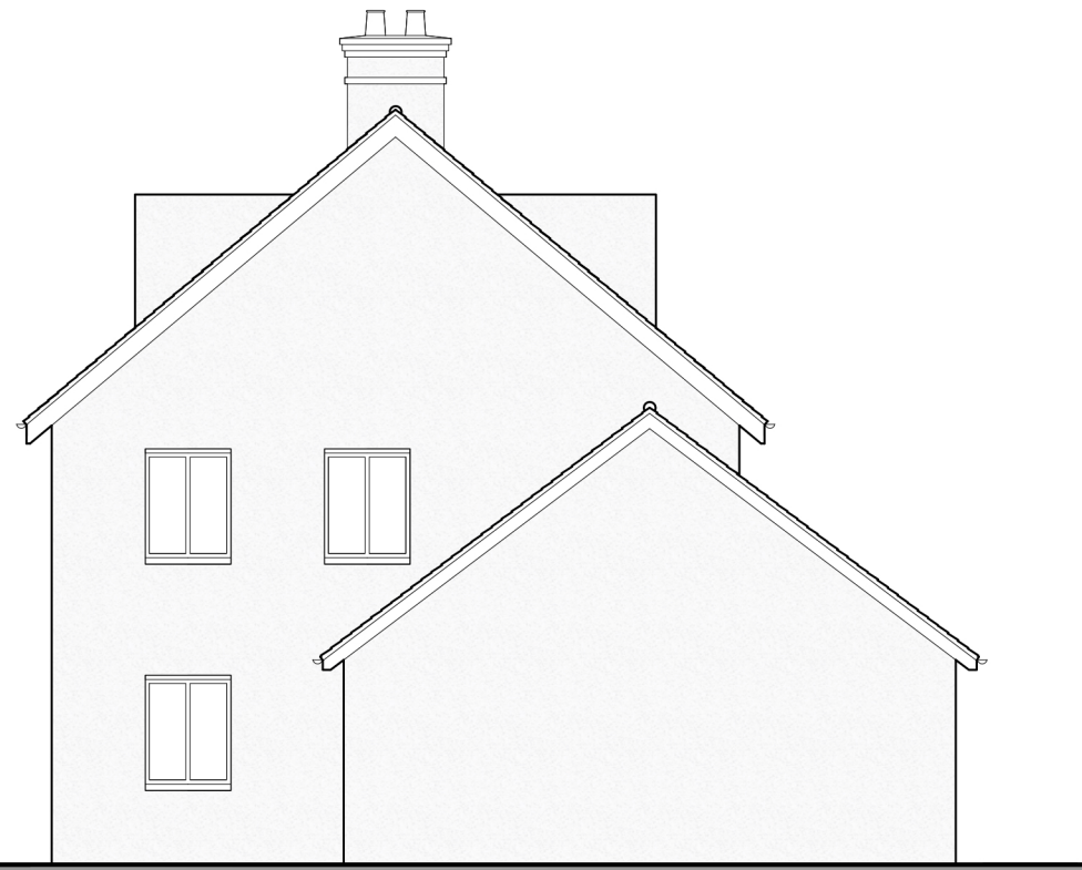
SIDE ELEVATION 1