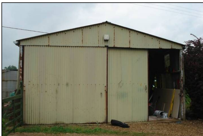
Figure m: An agricultural building