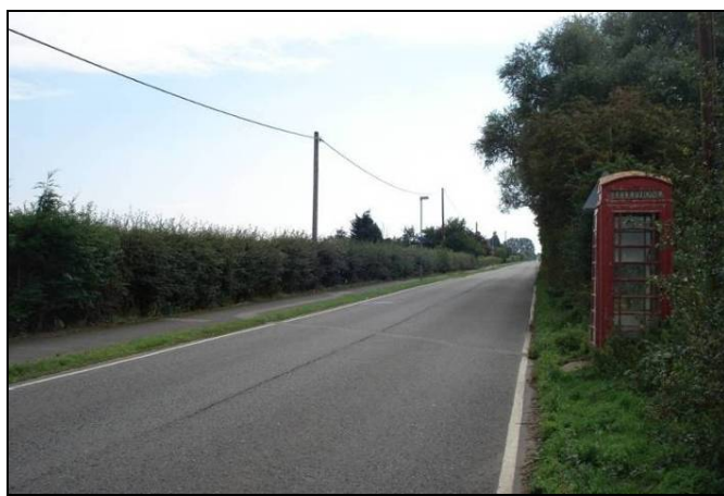
Figure c: Views of Mill Road, looking south-west towards the A14