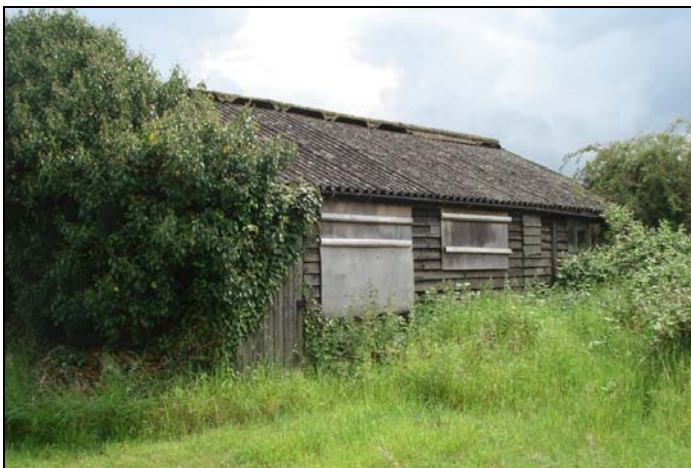
Figure j: A piggery