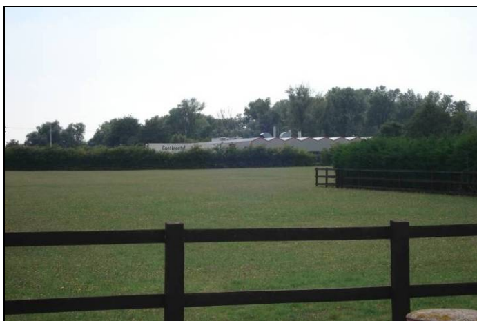
(v) View of Stubbins Marketing Ltd from its entrance on Oaktree Road