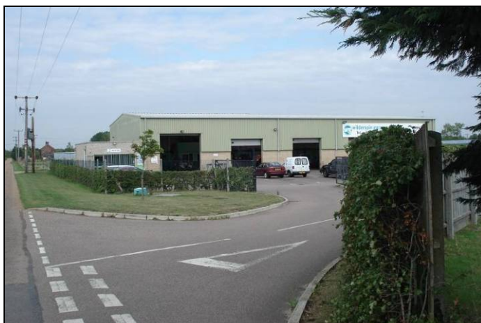
(iv) View of Stubbins Marketing Ltd from the west to east section of Oaktree Road