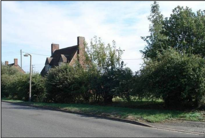
Figure i: A 'chalet' style dwelling