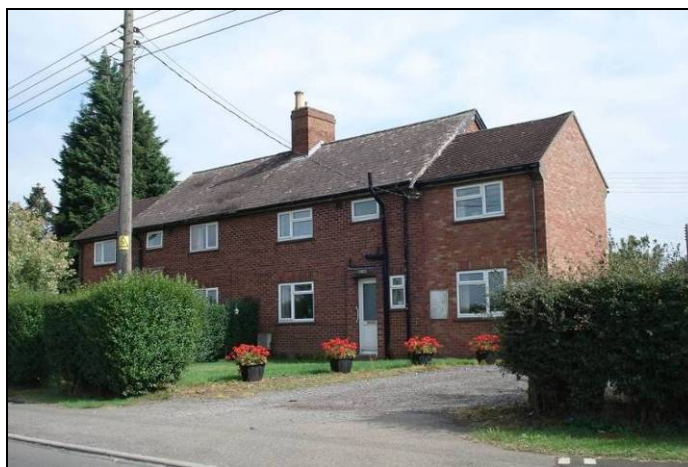
Figure h: A pair of extended semi-detached dwellings