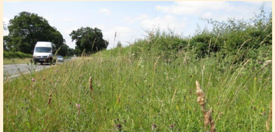
Chalk grassland roadside verge with remnant grassland flora.