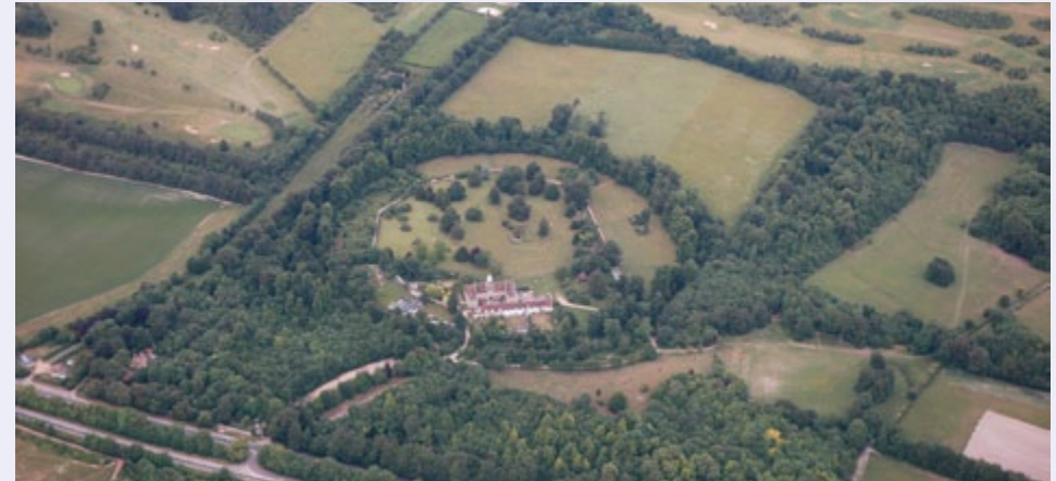
Wandlebury Hill Fort from the air in 1980. The wooded concentric earth bank can be clearly seen.