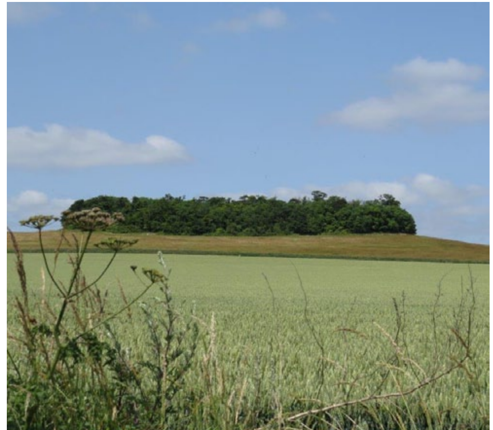
Beech hanger on top of a hill, surrounded by arable fields, near Dullingham.

Biodiversity and geodiversity are crucial in supporting the full range of ecosystem services provided by this landscape. Wildlife and geologically-rich landscapes are also of cultural value and are included in this section of the analysis. This analysis shows the projected impact of Statements of Environmental Opportunity on the value of nominated ecosystem services within this landscape.