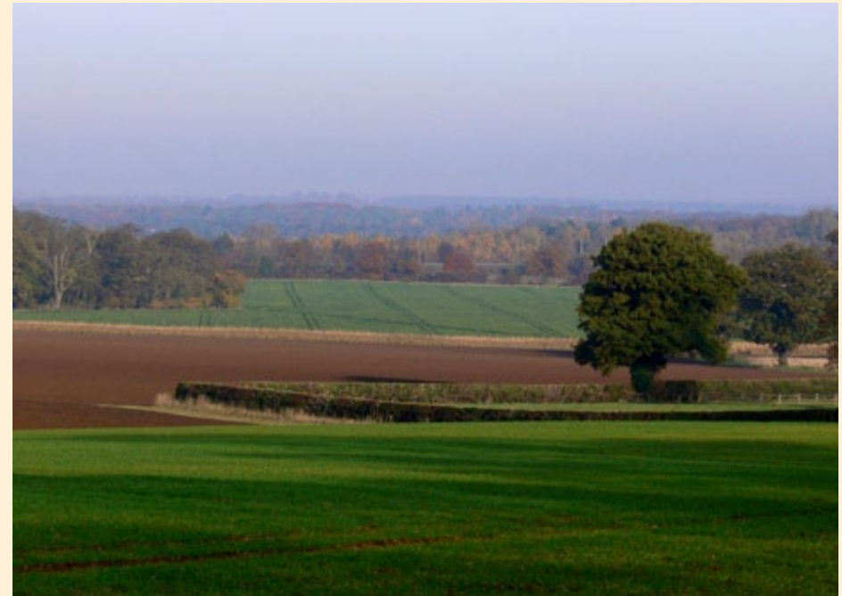
Looking from the open chalk landscape near Gazely towards the more wooded Brecks NCA.