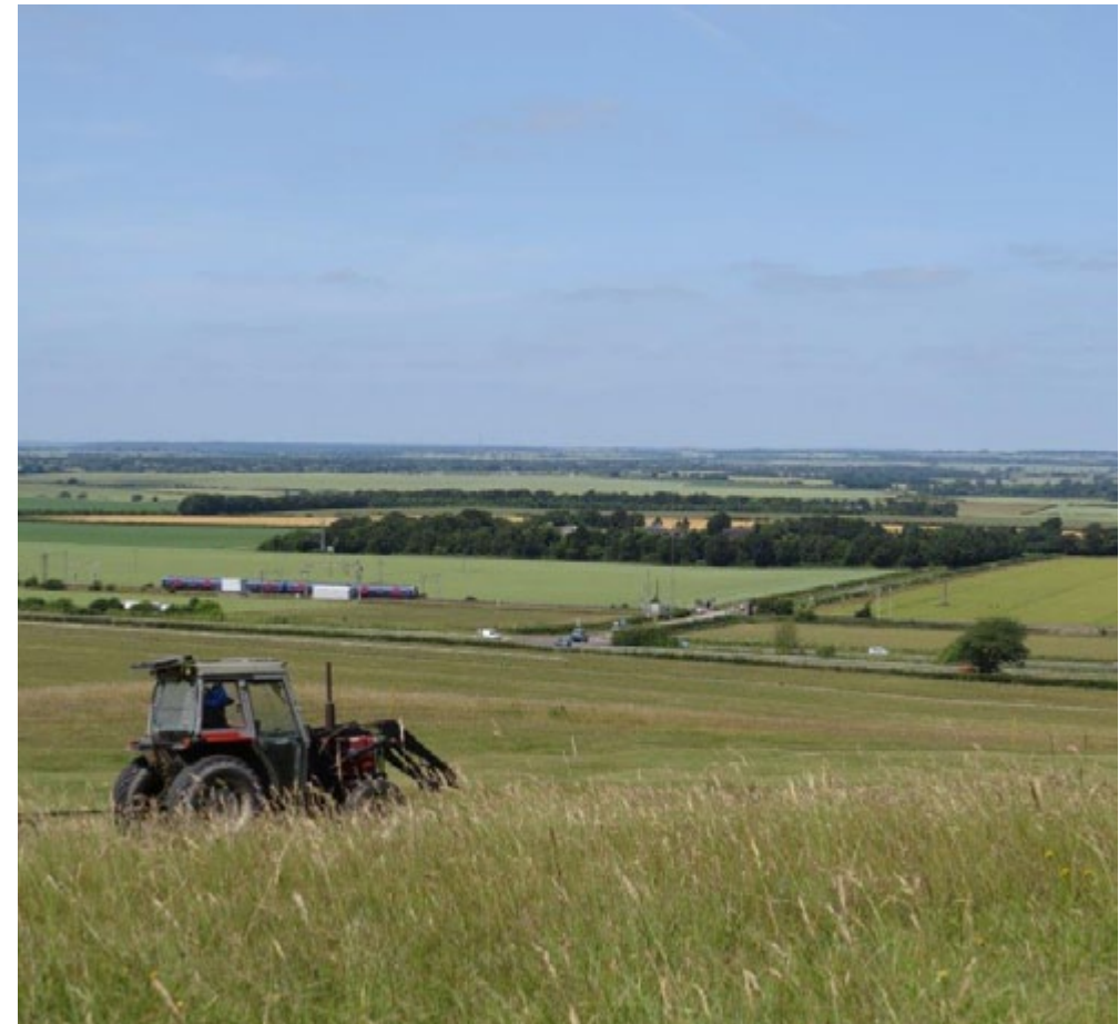
Looking towards Cambridgeshire claylands and modern transport routes from Therfield Heath.