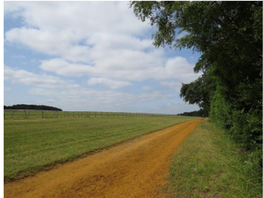
Gallops, near Newmarket showing rectilinear field pattern, enclosed by tall hedges and currently species-poor grassland.

The chalkland landscape is united with the rest of the East Anglian NCAs as a major food producer, with arable farming being the predominant land use. The smooth, rolling chalkland hills are dissected by the two gentle valleys of the rivers Granta and Rhee, which converge flowing westward into the River Cam just south of Cambridge. The Rhee begins at Ashwell Springs in Hertfordshire, running north then east 19 km through the farmland of southern Cambridgeshire. The longer tributary, the Granta, starts in Essex and flows north into the East Anglian Chalk NCA near Saffron Walden. The underlying chalk aquifer provides functional links between these areas and the population of East Anglia, whose water the aquifer supplies.