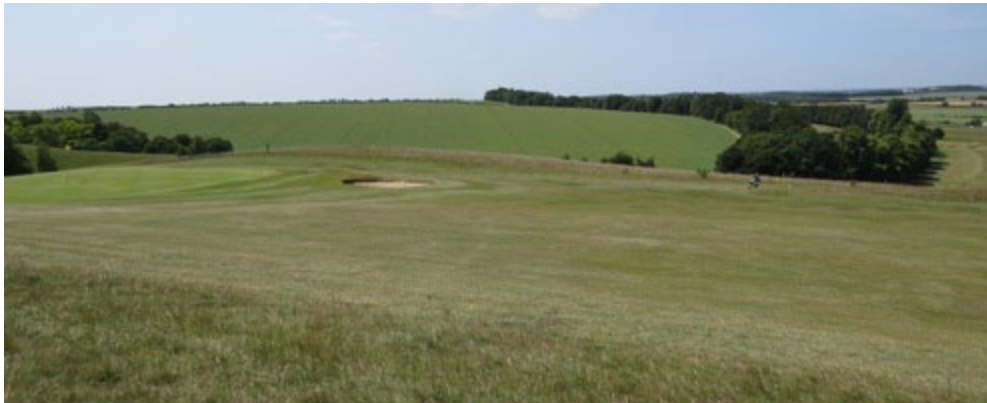
Golf course on Therfield Heath with good biodiverse grassland.