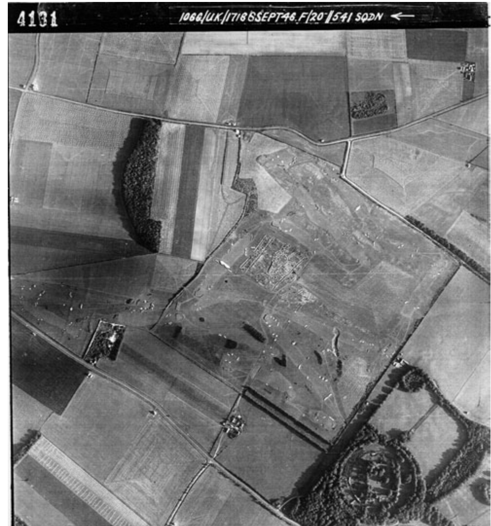
Trees growing on Wandlebury hill fort and surrounding land seen from a 1946 aerial photograph.

Spring-fed prehistoric settlements developed on the chalk downs (such as at Ashwell, Melbourn and Steeple Morden), on the terraces of the Cam valley and around exploitation sites where flint nodules used for tool making (for example at Duxford and Thriplow) were exposed in the upper strata of the Chalk. Neolithic and bronze-age ceremonial and funerary monuments are widespread across the Chalk (for instance at Therfield Heath), attesting to their long-term