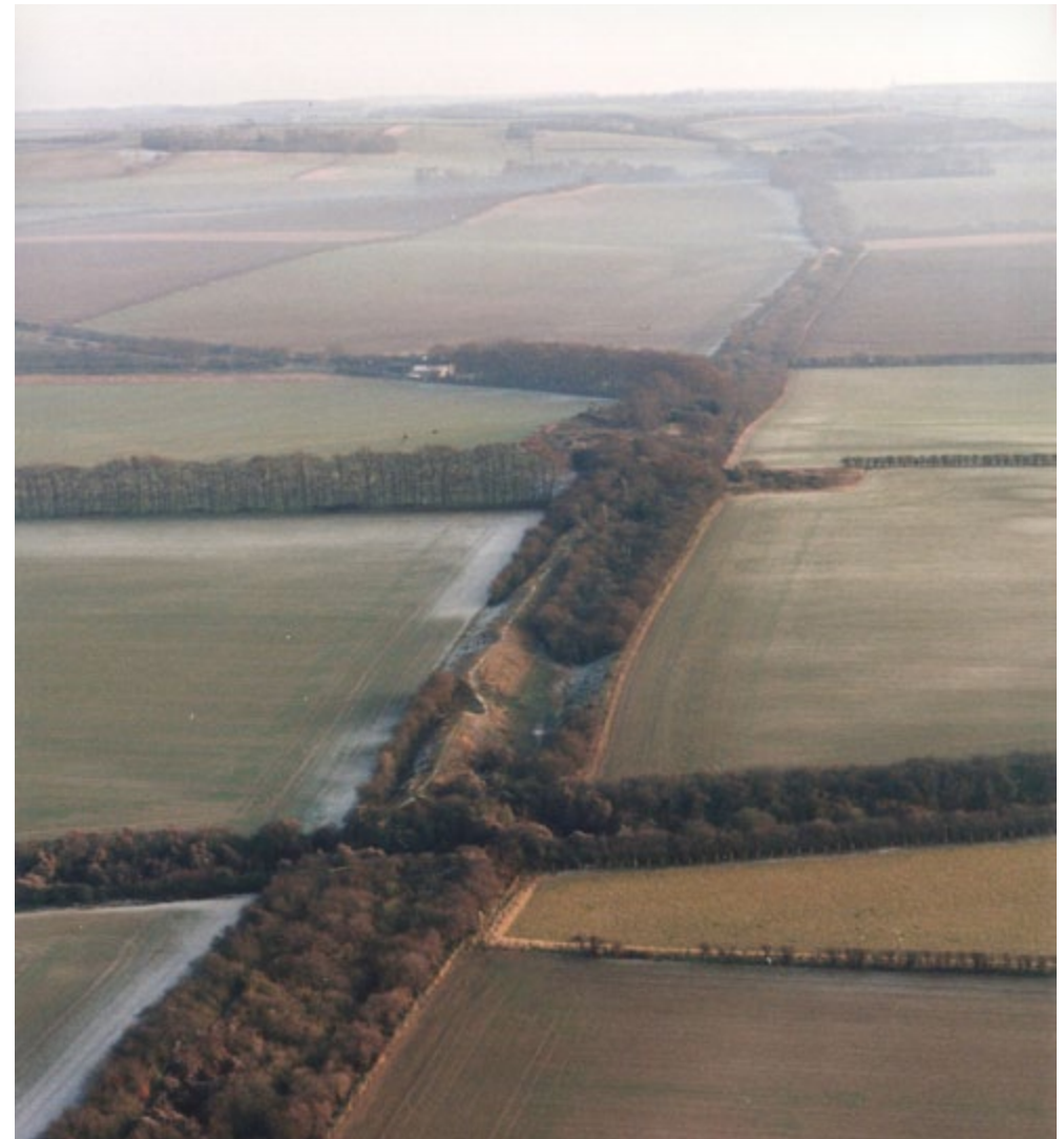
Fleam dyke, one of the four ancient defensive earthworks preventing access to East Anglia.

The NCA has experienced dramatic land use changes in past and recent times. These changes have influenced the present nature, location and extent of the wildlife resource. There is recognition of the importance of the remnant habitats, sometimes confined to roadside verges; the small scale of these sites makes management - and therefore maintenance of biodiversity value - very difficult.