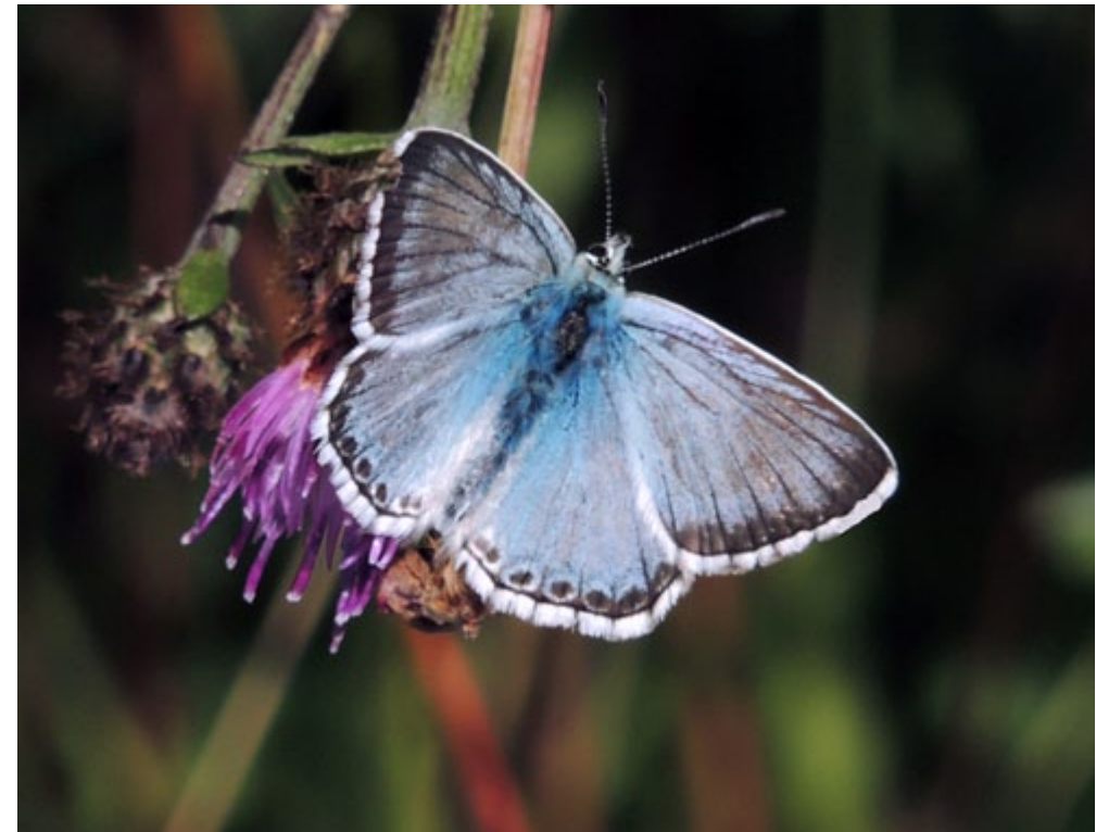
Chalkhill blue butterfly feeding on knapweed, on a small remnant grassland site.