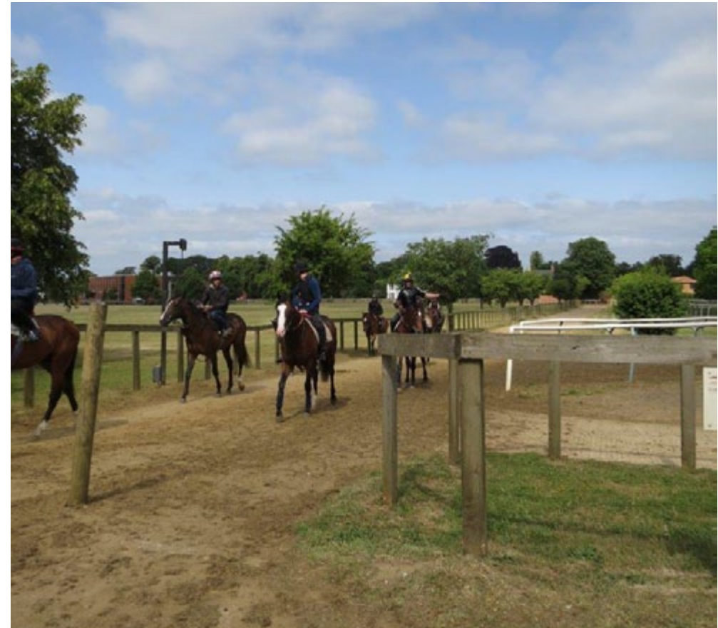
Racehorses setting off for morning exercise near Newmarket.

Arable farming, as well as sheep grazing, have been significant since the prehistoric period; their importance has ebbed and flowed, as in the other chalk and limestone plateaux and downs of southern England. The smooth, rolling chalkland hills were historically grazed by sheep but the land use is now dominated by large-scale cereal production. The large fields are enclosed with low thorn, and characterised by often 'gappy' hedgerows and few trees. There is very little grazing pasture or livestock except within the small river valleys. Medieval deserted settlements testify to the shrinkage of arable cultivation after the 14th century, and there is an abundance of archaeological sites dating from the Neolithic Period. Also prominent are Anglo-Saxon linear dykes (Devil's Dyke,