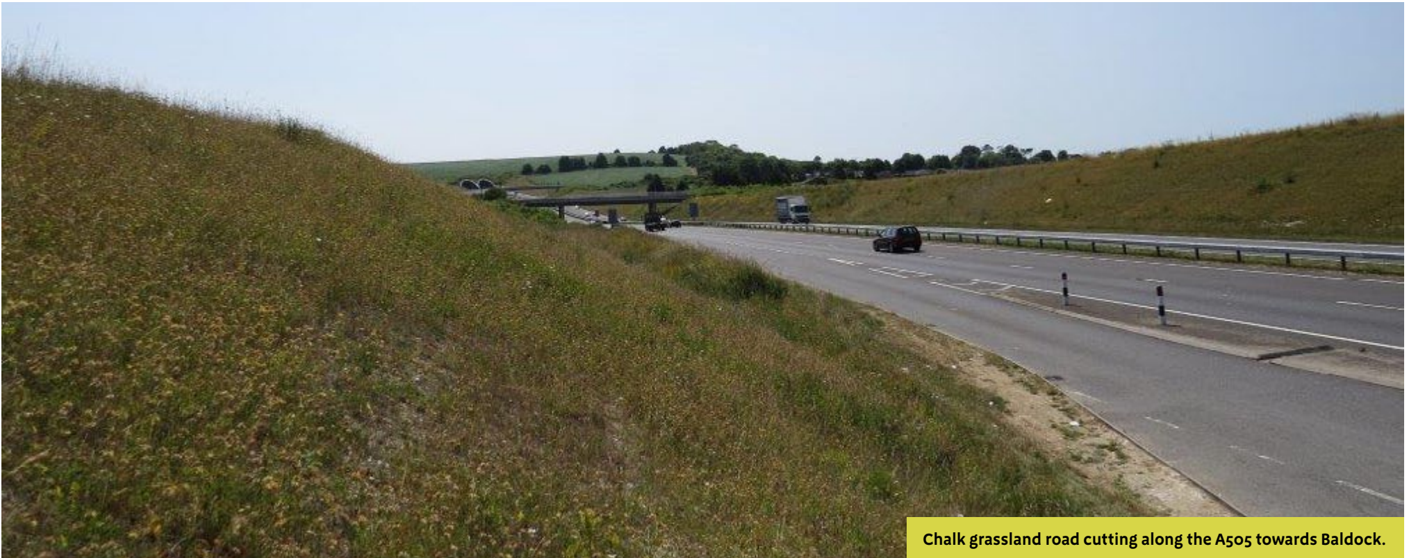
Chalk grassland road cutting along the A505 towards Baldock.