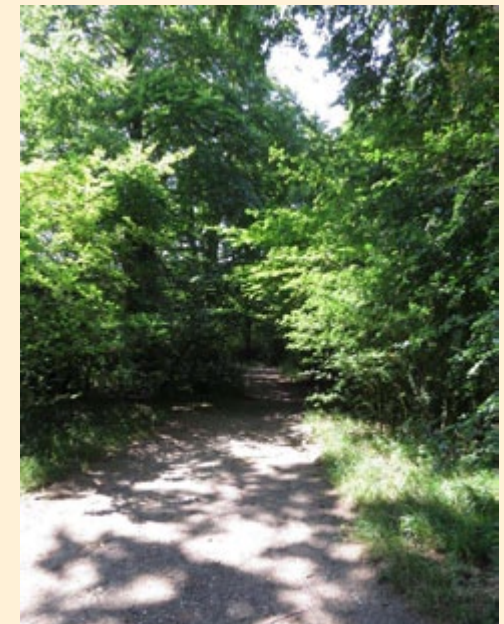
Icknield Way, prehistoric routeway as seen today.