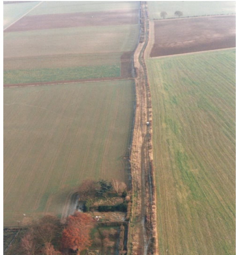
Worsted Street, Roman road, clearly seen from an aerial photograph.