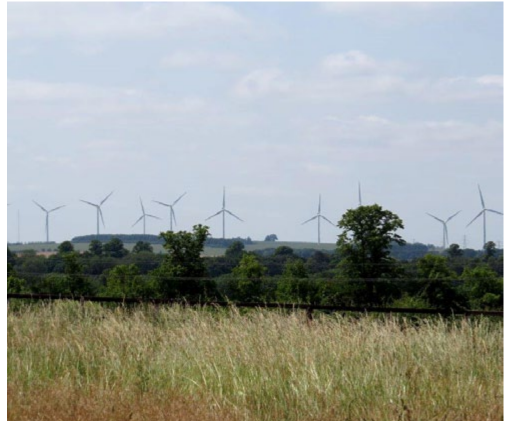
Wadrow wind farm, north of Balsham, is a prominent feature in the landscape.