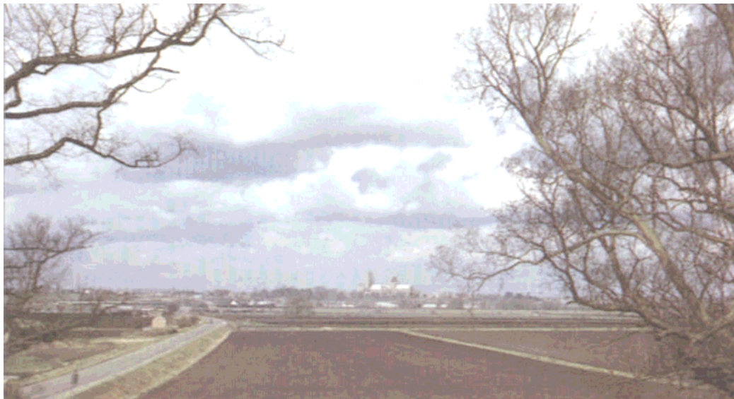
The Huge Sky of the Fenland Landscape - Looking towards the Isle of Ely and Ely Cathedral.

Typical trees and hedgerows include Ash, Oak, Poplar, Willow species, Hawthorn, Dogwood, Horse chestnut and Sycamore.