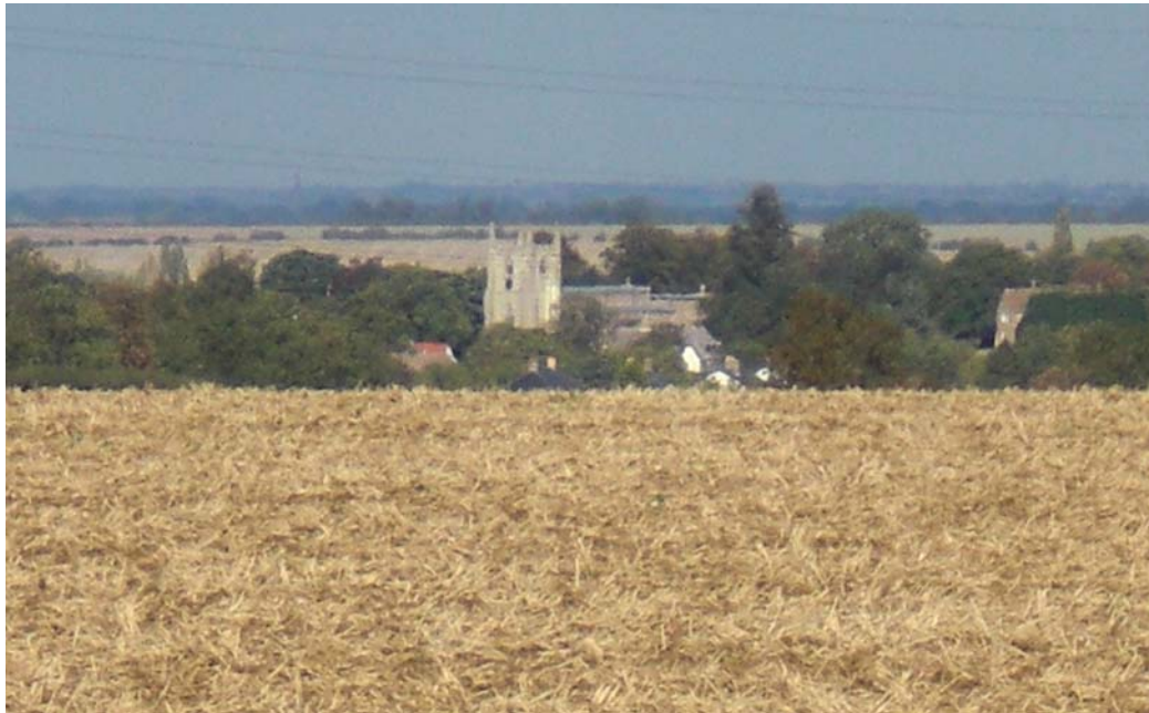
Near Elsworth - shallow valleys in the Clayland landscape

Medieval earthworks including deserted villages the major feature of visible archaeology.