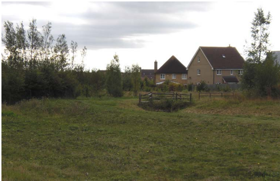
SUDS at Cambourne – Areas for water storage incorporated into public open space

3.80 Further information and relevant contacts for SUDS systems can be found in Appendix 2.